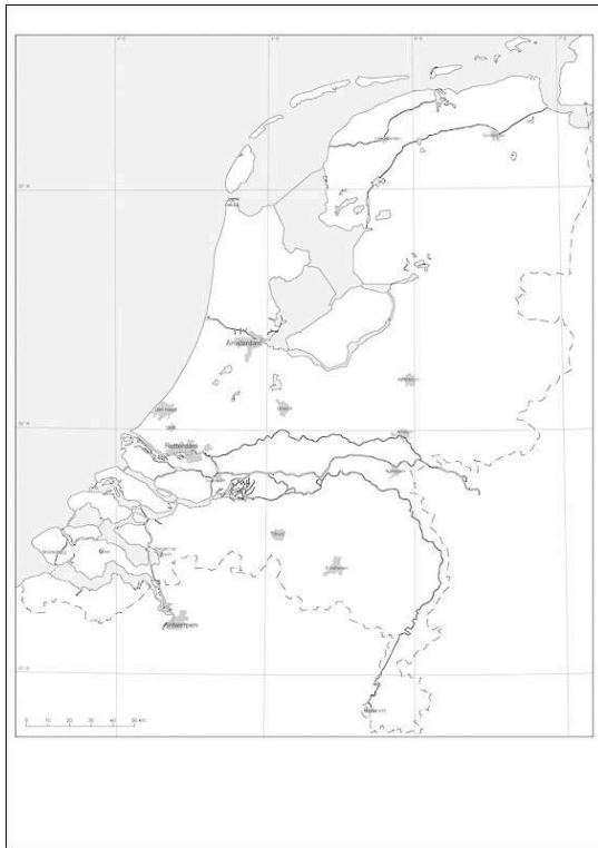
Illustration 1 - Basic map of The Netherlands presented to the interviewees

The Dutch coast is composed of three distinguished geomorphologic areas: in the south, the delta of Zeeland, in the centre, the dunes area, in the north, the Wadden sea area.